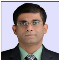
Hon. Shri. B. Venugopal Reddy, IAS

Minister of State, Higher & Technical Education, Government of Maharashtra