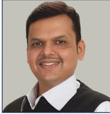
Hon. Shri. Devendra Fadnavis