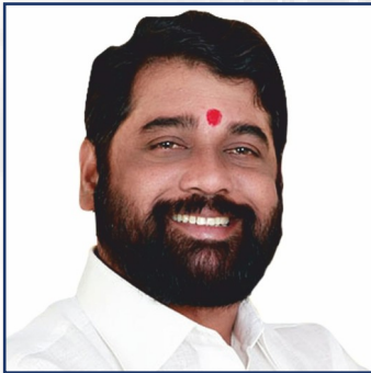
Hon. Shri. Eknath Shinde