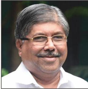
Hon. Shri. Chandrakant Patil

Minister, Higher & Technical Education, Government of Maharashtra