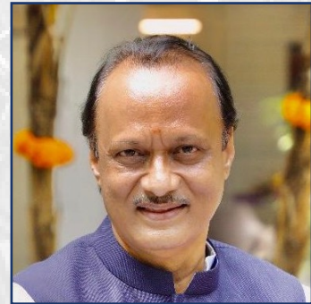
Hon. Shri. Ajit Pawar